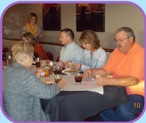
It was a great night to get together.