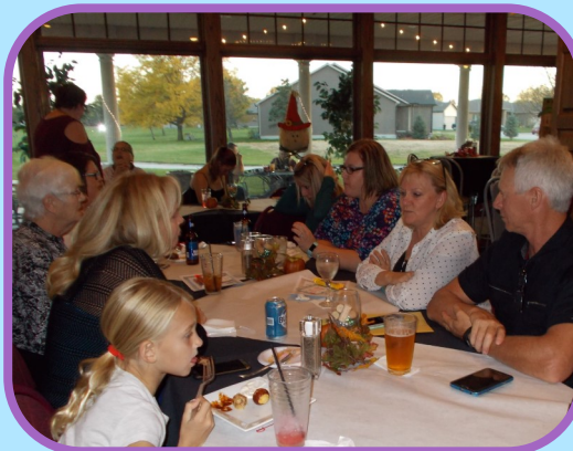
Lots of visiting & catching up was done during the social.