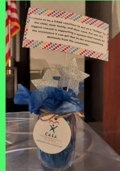
A table centerpiece