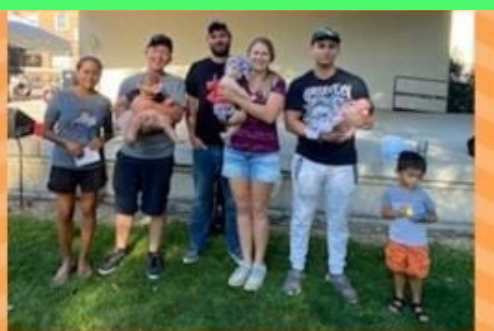
0-6 MONTH WINNERS

The Grinch even made an appearance at our booth.