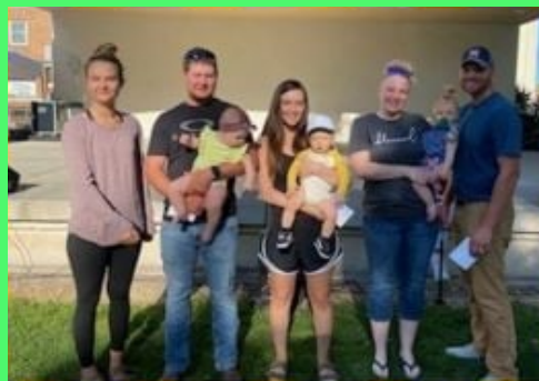
7-12 MONTH WINNERS