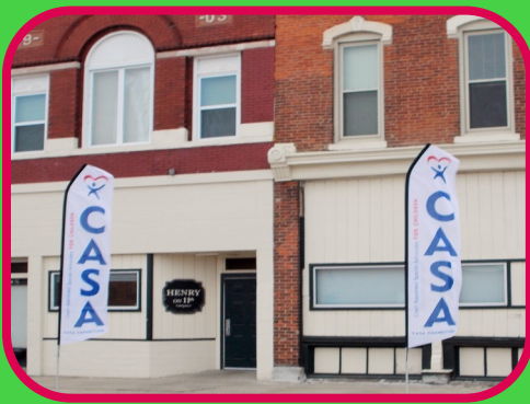
The Henry on 11th was the perfect location.