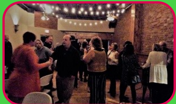
Some of the guests enjoying themselves.