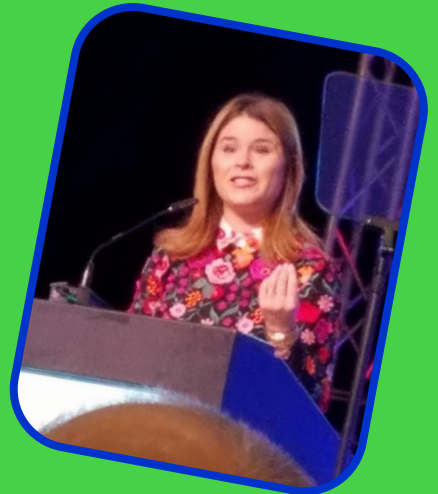
Jenna Bush Hager, one of the main stage presenters