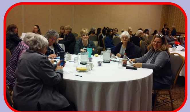
One group of volunteers from CASA Connection who attended the conference