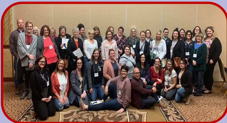
Staff members from CASA organizations across Nebraska