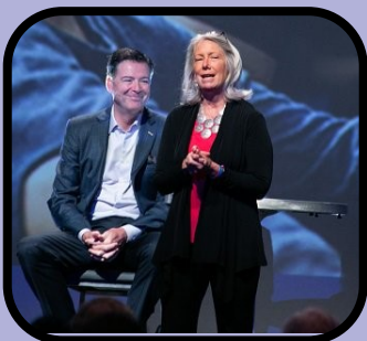
James & Patrice Comey speak about being foster parents as well as their dedication to CASA