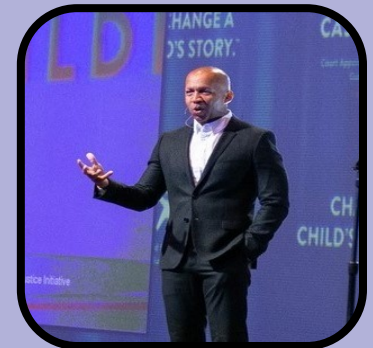
Bryan Stevenson, Founder & Executive Director of the Equal Justice Initiative of Mobile, Alabama